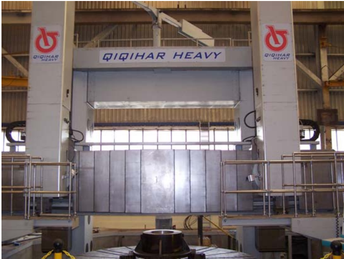
Table diameters from 111" to 177" Swing/turning diameters from 124" to 196" Maximum part heights from 78" to 157"