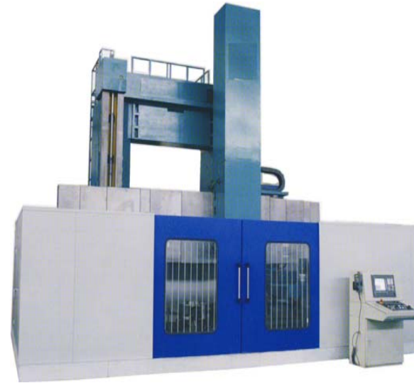
QIQHAR DVT Vertical Lathe