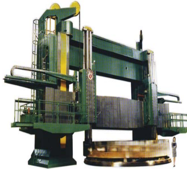
QIQHAR DVT Vertical Lathe