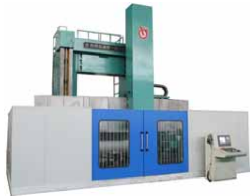
Vertical Turning Lathes