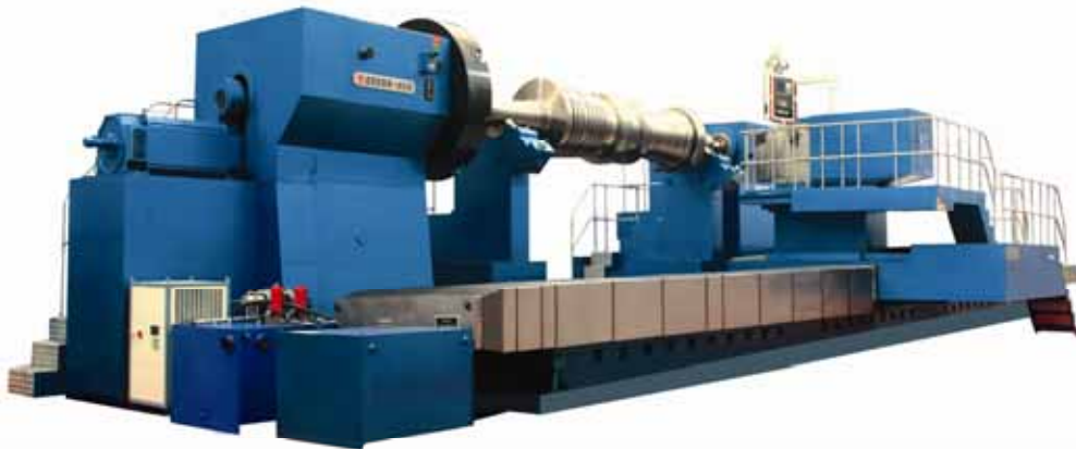
Horizontal Turning Lathes